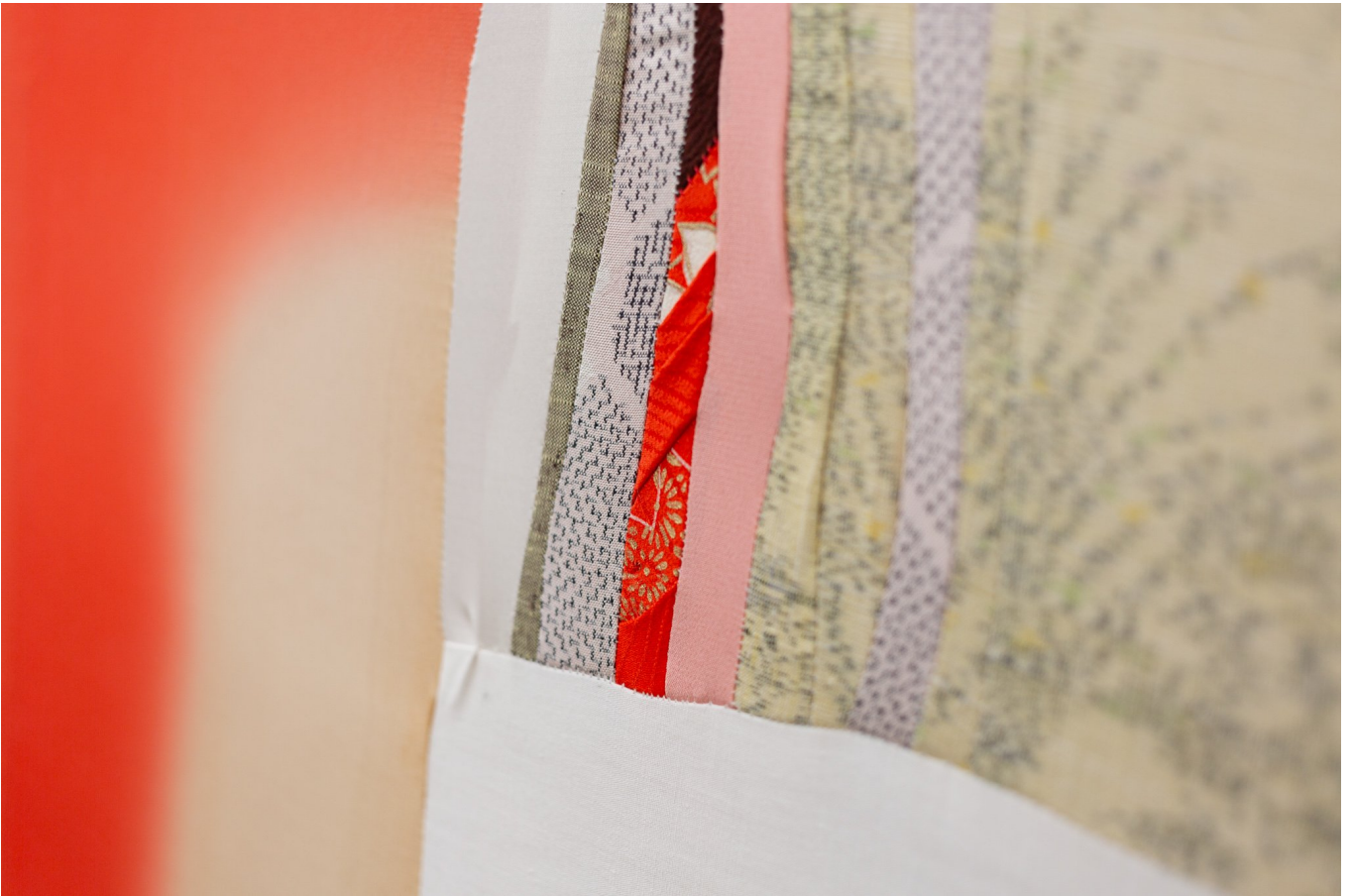
Hikalu Clarke, At the Threshold (detail), 2022, retroreflective polyester, vintage Japanese fabrics, 157.5 x 254 cm