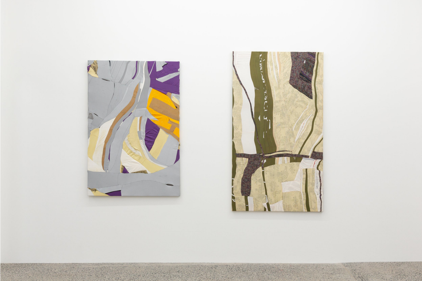
Hikalu Clarke, Dredge . Installation view, Sumer, Tauranga, August 2022