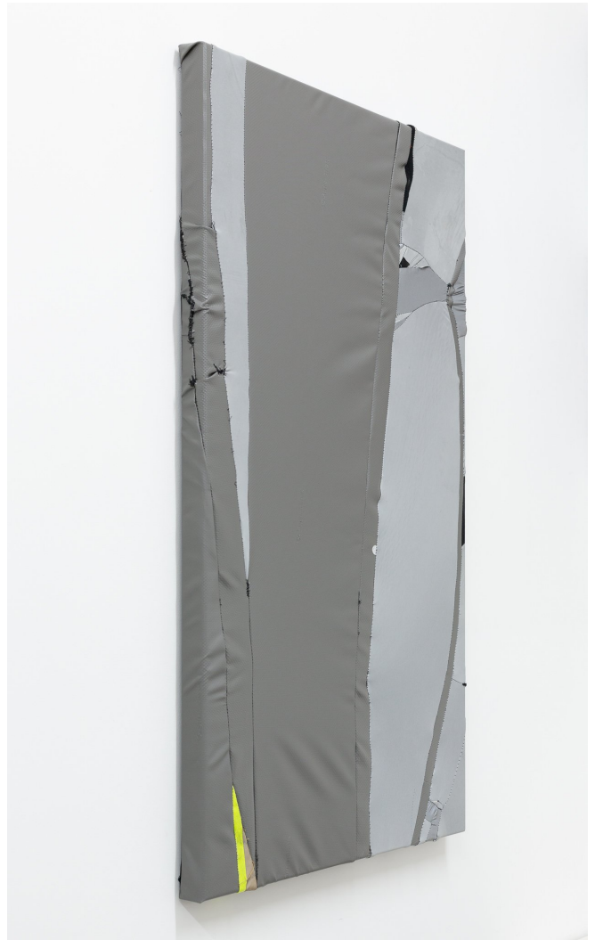
Hikalu Clarke, You're Safe Now , 2022, retroreflective polyester, kevlar aramid, at-risk prisoner mattress fabric, cotton thread, 100 x 60 cm