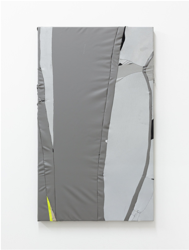
Hikalu Clarke, You're Safe Now , 2022, retroreflective polyester, kevlar aramid, at-risk prisoner mattress fabric, cotton thread, 100 x 60 cm