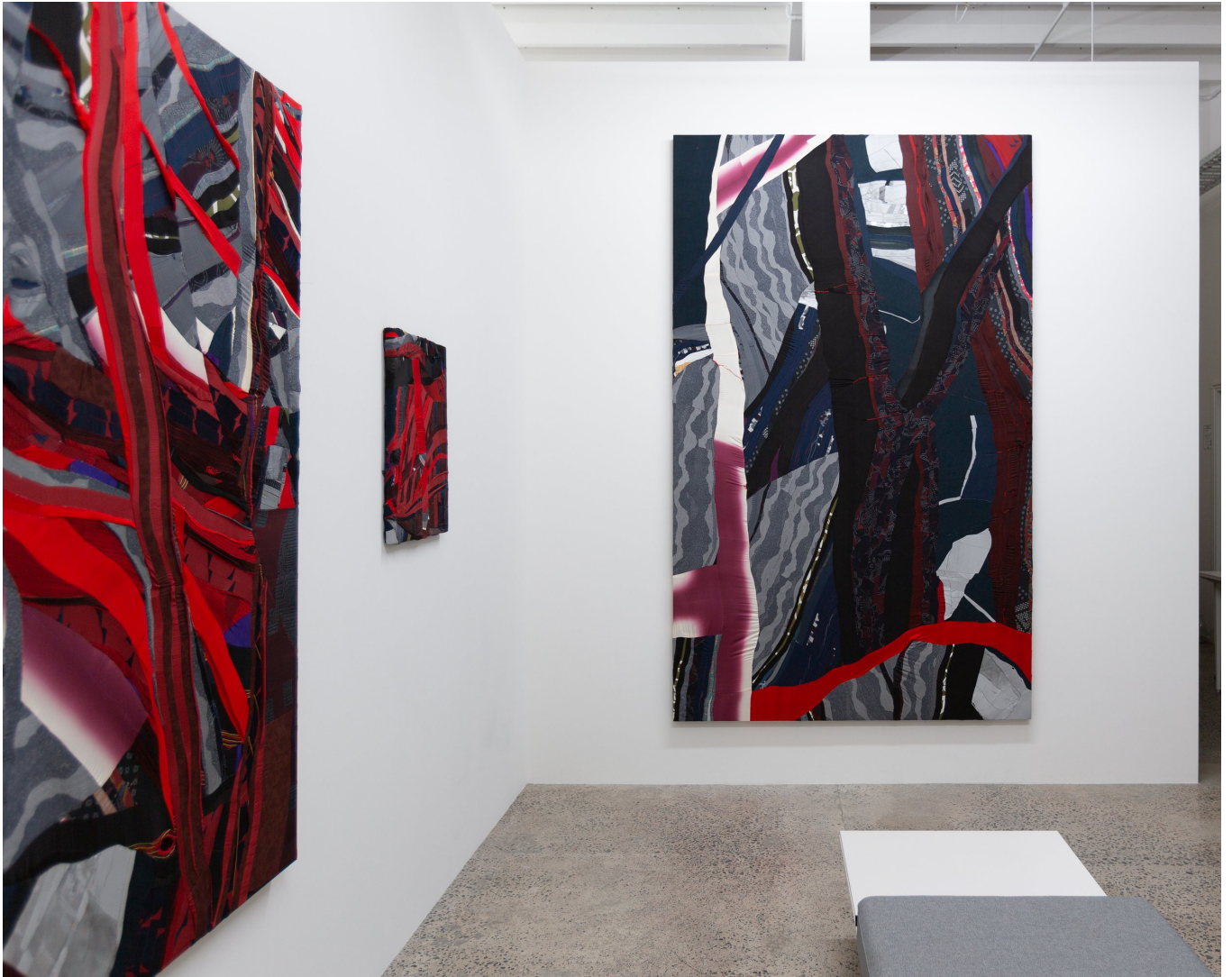
Hikalū Clarke, Dredge . Installation view, Sumer, Tauranga, August 2022